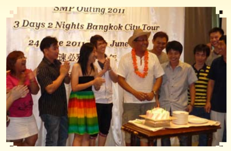
A birthday song and cake for employees born in June

速必雅包装有限公司 superior Multi-Packaging SM ug 2011 2 Nig makok (