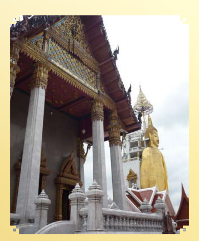
The magnificent Standing Buddha

More than 150 SMPL employees and 30 colleagues from SMP overseas companies met in Bangkok from 24 to 26 June 2011 for 3 days of excitement. During the outing, the group visited the famous Standing Buddha, Four-face Buddha, snake farm and skate restaurant, Royal Dragon. Employees also had fun shopping at gems, leather and honey shops and the Mah Boon Krong and Platinum malls.