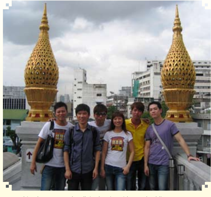
Nothing beats a good walk in the city with your buddies

当然,每年的旅行不仅在于得奖和购物,这是一个员工 在非工作环境下获得乐趣,建立超乎办公室的可贵友情 的良好机会!